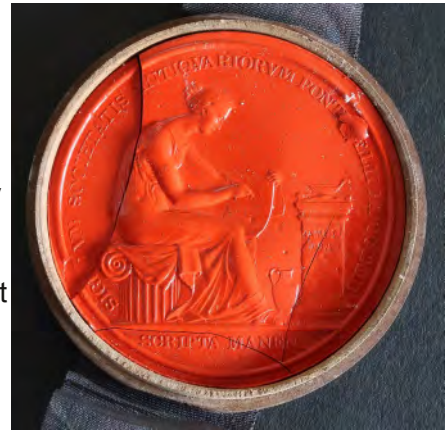
The seal on Bridget Atkinson's membership certificate