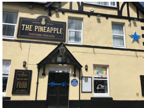
The current Pineapple Inn with its blue plaque