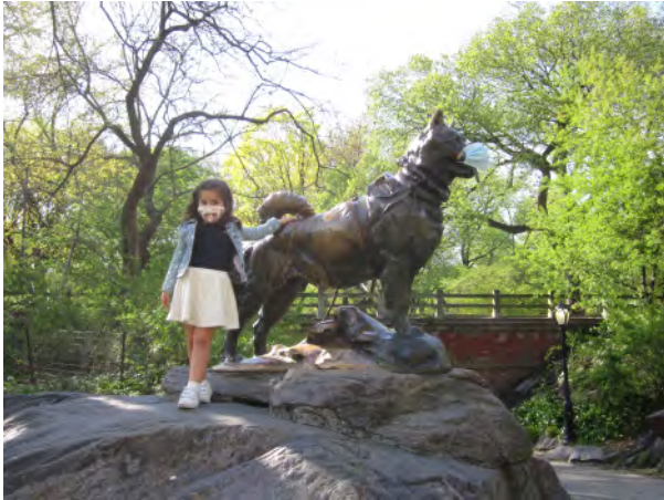
Balto in Central Park

Delight and disease compete for us. In Riverside Park, New Yorkers run, read, walk dogs, and swerve six feet from each other, wearing masks store-bought or home-made. On the grand outcropping of the Manhattan Mica Schist at 84th Street, sparkling ancient lava reworked by glaciers, a sunbather stretches, and a man shows his son how to climb, where Edgar Allen Poe sat at night to gaze at the wilderness of New Jersey. But the City has removed the hoops from lonesome basketball courts, where kids kept gathering. The statue of Eleanor Roosevelt, with sensible shoes and observant eyes, sports a red scarf wrapped around her nose and mouth. Central Park's statue of Balto, a sled-dog who ran serum to Nome in the 1925 diphtheria outbreak, likewise wears a mask.