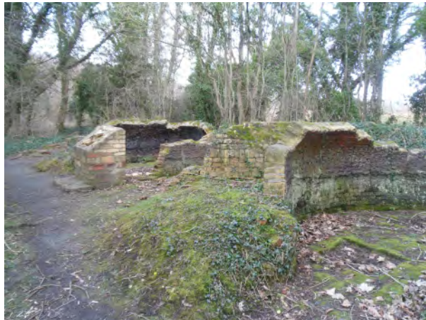
Coke Ovens near Isabella Pit

We followed the route of the 1876 railway and eighteenth-century waggonway to High Street House, better known as George Stephenson's cottage where we discussed the reasons for its location and function at the junction of the waggonway and the road. The Wildlife Nature Reserve contains some unique plants which tolerate the heavy metal contamination from waste from the now defunct Allendale Lead Mines, and a remarkable regeneration of oak trees. The Tide Stone, erected in 1783, marked the limit of Newcastle's claim to the Tyne and the then high tide mark. In the nineteenth century the Tyne Commission dredged the river to this point, lowering the river bed by twelve feet.