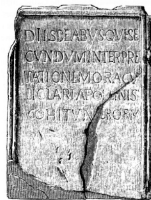
The dedication from Housesteads, now in the Great North Museum; picture RIB 1579

From the fort of Housesteads on the Wall comes a fine inscribed slab now in the Great North Museum. It is dedicated 'To the gods and goddesses according to the interpretation of the oracle of the Clarian Apollo – set up by the first cohort of Tungrians'. We now know of at least twelve almost identical dedications from various regions of the empire. These dedications were a general initiative probably ordered by the emperor Marcus Aurelius (reigned 161–180), who had perhaps himself consulted the oracle at Claros (western Turkey) about what could be done to protect cities and military bases throughout the empire from devastating pandemic disease.