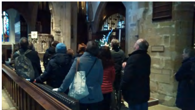
The group in St Nicholas Cathedral