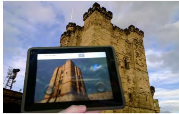
The Castle Keep on a mobile phone and in the real world