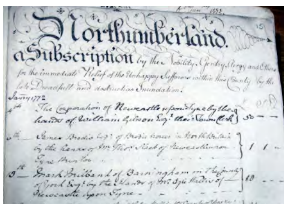
One of the pages of the 1771 Tyne Flood Papers volume, digitised and on our website.