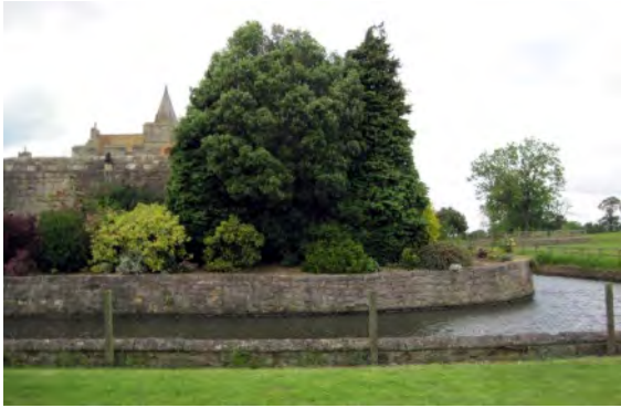
Moated Markenfield

We had a guided tour around the newly restored formal and informal gardens with a very knowledgeable guide, so by the time we entered the house we knew all about the history of both the gardens and the hall, and of the family's colourful past. Most of the objects on display inside are from the original furnishings bought from Lapworths in London in 1863.