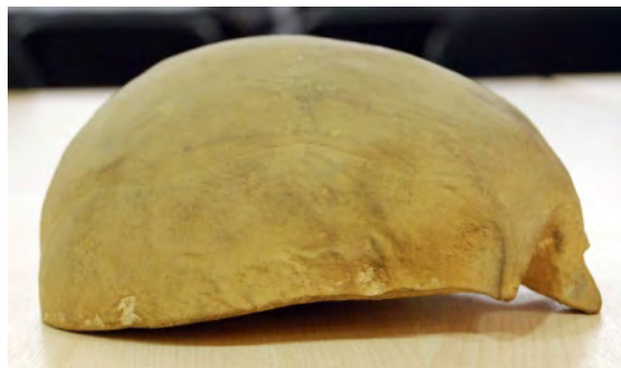
The cast of Bede's skull