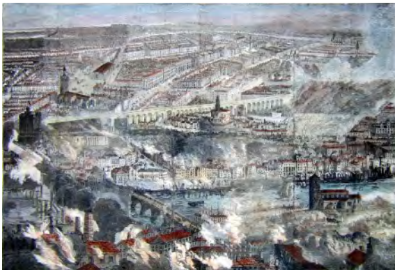
Engraving of the Great Fire of Tyneside from the Illustrated London News, 14 Oct 1854