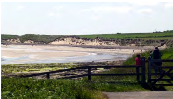
Alnmouth Bay in June

The first walk of a new year's programme is traditionally an urban one, a chance to blow away the Christmas cobwebs without overtaxing those feet. This year's will be a maritime walk in North Shields on 29th December. We will be able to take lunch afterwards in the Old Low Lights which is opening specially for us. Details to be confirmed; see our website for information.