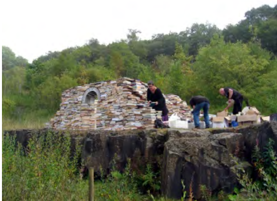
Building the Milecastle