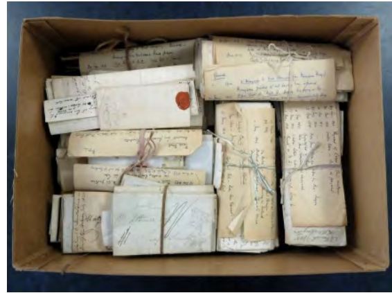
Atkinson papers still to be researched