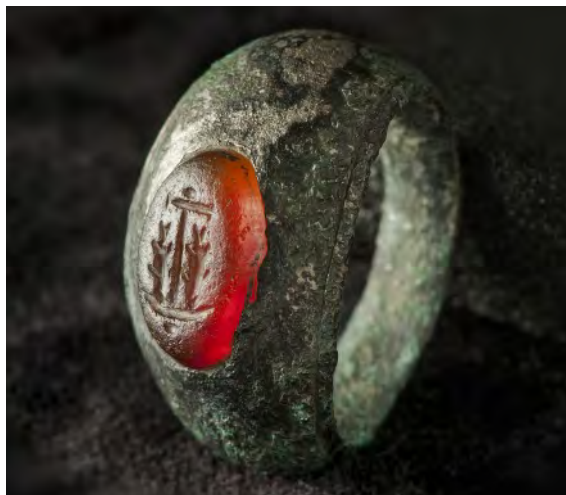
The Carnelian Ring from Binchester