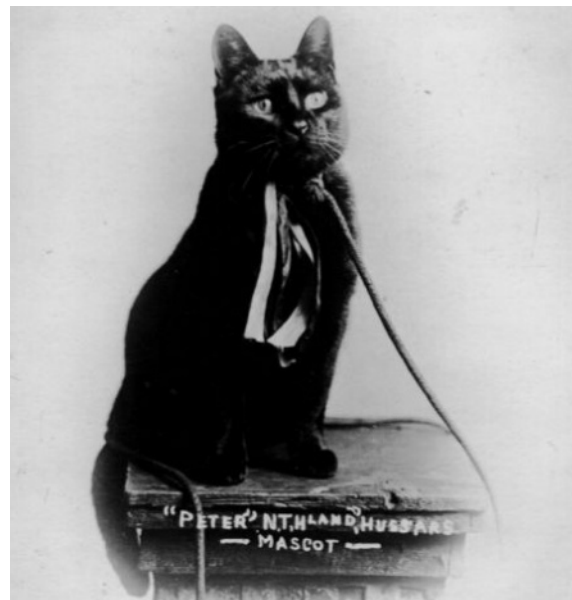
Peter the Regimental Cat