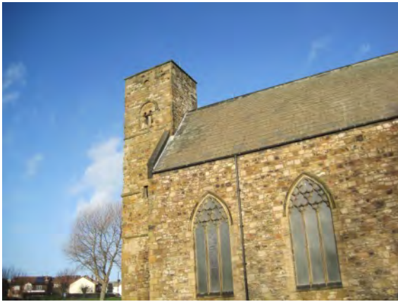
The western tower of St Peter's Wearmouth, picture courtesy Sue Ward

lifetime, or healing miracles associated with him at death. Elsewhere in the Late Antique world, including other parts of Northumbria such as Lindisfarne, these elements were seen as central to the church's role. Wearmouth and Jarrow seemed to be following a different tradition, perhaps that of the Southern Gaul monastery of Lérins, where Benedict Biscop had been tonsured and another place where the cult of relics and miracles were not favoured.