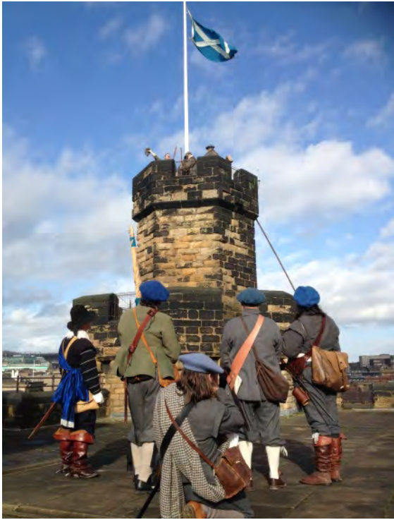
The Scots Flag being raised over the Castle Keep, picture courtesy Peter Cumisky

while paying visitor numbers are ten per cent up on last year.