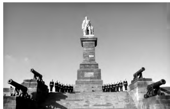
The Collingwood Memorial 'dressed' for the occasion with a contingent of naval ratings.

Admiral Collingwood, Nelson's second-in-command at Trafalgar and one of Tyneside's great heroes, died off Menorca on 7th March