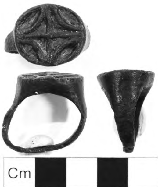
The recently discovered bezel ring.

Finds Liaison Officer for the region, and since September 2009, the Society has very generously provided me with office space. Visitors to the Society office will have witnessed much of the work that the PAS does, including supervising student volunteers. I would like to express my thanks to the Society for providing me with office space over the past months; my volunteers and I have greatly benefited. I will be moving in June to the newly available desk in the Great North Museum office.