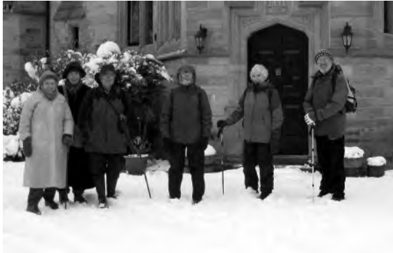
The intrepid Antiquaries in front of Castle Hill House

A small hardy group set off from Wylam station on January 2nd, to walk round the environs of Wylam and look at wagonways. There was thick snow on the station platform, but Denis Peel took us up a private walkway to Castle Hill House – a big Victorian house built by the same architect as the Mining Institute. It was a NHS convalescent home for a long time, and is now a combination of flats and additional self-contained houses in the grounds.