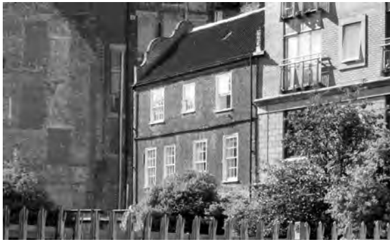
c. 1700 house in Rosemary Lane, in the heart of Old Newcastle

The website has also had a redesign, and is looking very good, at http://www.oldnewcastle.org.uk/news .