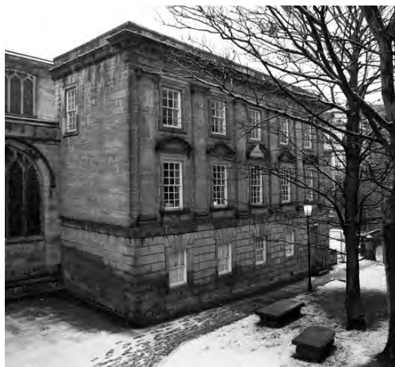
The Thomlinson Library, one of the many pictures in the new City Guide