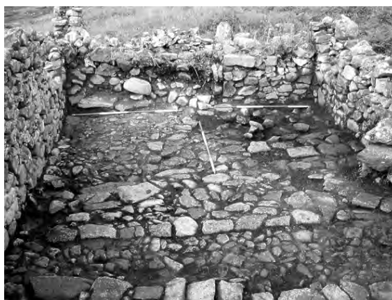
Excavations at Harrowbog

An initial review of the Sites and Monuments Record had revealed only a few possible sites classed as shielings in each valley. However, examination of aerial