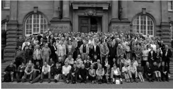
The Pilgrims en masse on the steps of South Shields Town Hall

cavalry re-enactors, together with “camp following” ladies and children.