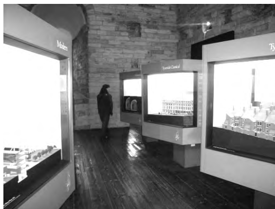
The new exhibits at the Castle Keep; picture courtesy Paul McDonald

The Castle Keep has set new records this year for both visitor numbers and revenue following the addition of a new exhibit and changes to its pricing structure. Visitor numbers are 20% up on the same period of last year. In a typical week, there are around 450 adult visitors and 150 children. Most come from outside the North East, with many from overseas.