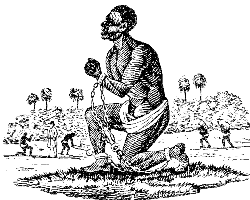
The engraved image of a slave, by Thomas Bewick.