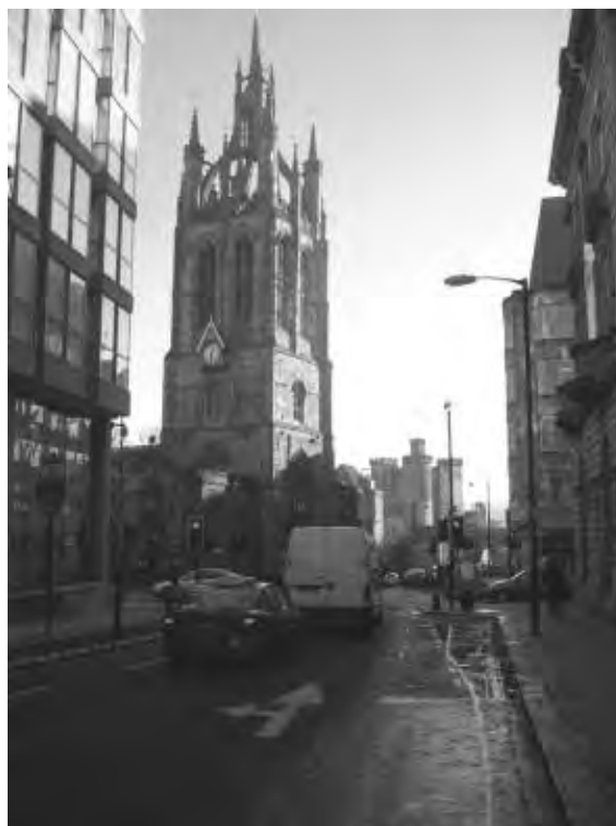
The Heart of the City today; picture courtesy Grace McCombie

The aim of 'Heart of the City' is to make improvements to the whole Castle, the Cathedral and the area around them, and to help people to understand the importance of this area and these buildings: the medieval core of Newcastle, the nucleus from which our city has grown. The City of Newcastle,