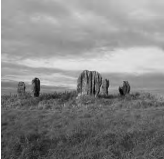
Duddo stones