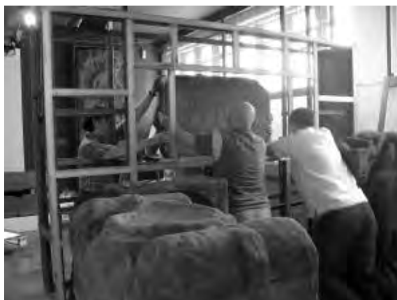
The Milecastle 38 inscription being eased from the position it had held since 1959.