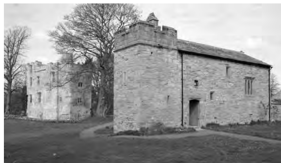
Dilston Chapel and Castle today

The fifteenth-century tower house of Dilston Castle, and the early seventeenth-century Dilston Chapel have been restored and stabilised by the North Pennines Heritage Trust, with the help of grants from the Heritage Lottery Fund and English Heritage. This is Phase 1 of an ongoing project aimed at conserving and gaining recognition for the whole of the historic site. The Friends of Historic Dilston have been set up to support the North Pennines Heritage Trust in the maintaining, promoting and preserving of this important ancient site.