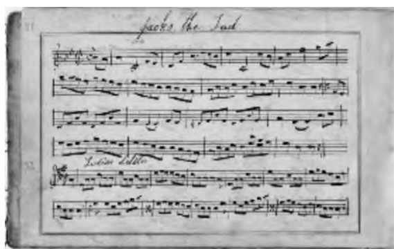
Jacks the Lad page in Baty's tune book; picture courtesy of FARNE (Folk Archive Research North East)

A new series of the BBC2 programme 'Balderdash and Piffle' has recently begun. The programme, which traces word etymologies and solves intriguing word mysteries, approached the Bagpipe Museum recently for permission to use a manuscript now in the Cocks Collection. The page that interested the programme's researcher contained a tune called "Jacks the Lad".