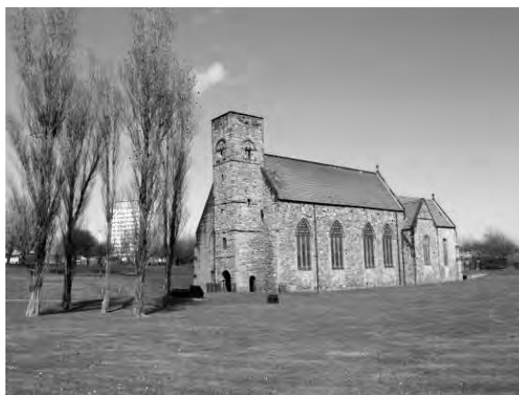
St Peter's Chapel

We will be exploring the history of the town from prehistoric times through to the creation of the parish of Sunderland in 1719. Much of what we know of Sunderland's Anglo-Saxon history comes from the writings of Bede, born on the lands belonging to the monastery of St Peter's at Monkwearmouth and its twin establishment, St Paul's at Jarrow. Bede spent his early years at Monkwearmouth, before transferring to Jarrow, thus witnessing the development of the twin monasteries as focal points of early Christianity in the north and