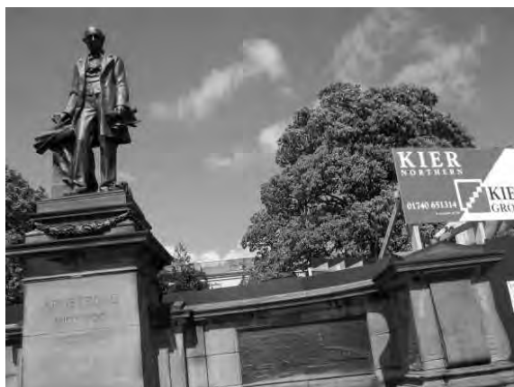
Lord Armstrong sharing his plinth with a builder's board outside the Hancock Museum

The Great North Museum planning has reached a more detailed stage. The Hadrian's Wall gallery now has a firm list of artefacts for the designers; not as many as we would have liked, needless to say, but all the old favourites will still be on display plus some new artefacts that have not been seen recently or often. We are now beginning to gather up images and draft text for the graphic panels, as well as working with the technically minded people in the University's Culture Lab to create some very exciting interactives. Our colleagues at the other Hadrian's Wall museums and sites are being very helpful in providing information for the electronic panels, which will be linked to the Hadrian's Wall model. This section looks set to be a really useful introduction to Hadrian's Wall. The Prehistory gallery has nearly reached this stage and we are working hard on the post Roman displays. We hope to get all the briefs finalised in the next few weeks.