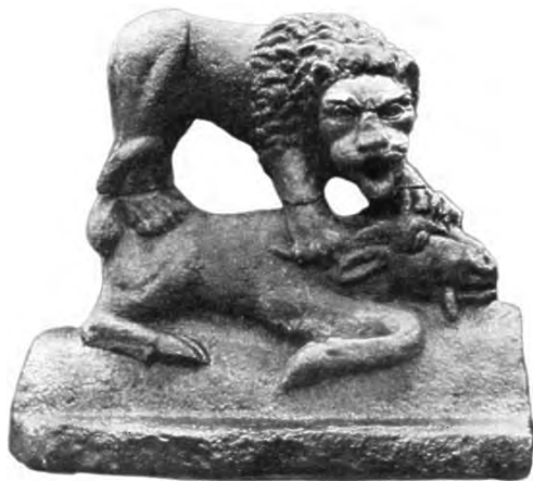
The Corbridge Lion