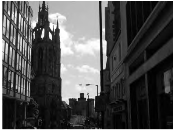
The neglected heart of our City

In later centuries, the importance of the site was emphasised by the presence of the Moot Hall and of County Hall but, in the name of progress and in the interests of slum clearance, the Castle Garth was ruthlessly