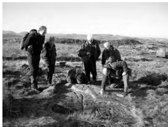
Rock art in Northumberland