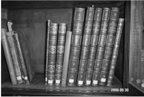
Some of our library stock

enough volunteers to be on site as there will only be one full time member of staff. The joint library will be open to all members and also to the general public, but there will probably be a reader's ticket similar to the County Archive Research Network card, CARN. Only our members will be allowed to borrow our books.