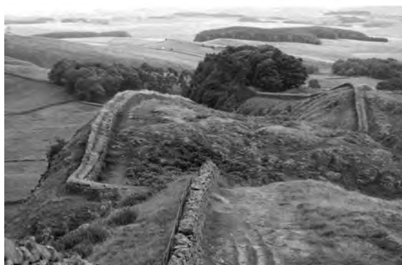
Hadrian's Wall looking east towards Housesteads

The Arbeia Society, in conjunction with ourselves, the Hadrianic Society, and the Cumberland and Westmorland Antiquarian and Archaeological Society, held a conference over the weekend of 3rd – 5th November 2006, at the Customs House in South Shields, following the publication of the new edition of the Handbook to the Roman Wall . Surprisingly, so far as anyone has been able to find out, it was the first full-scale conference about the Wall to be held for 30 years or more. There were contributions by speakers from Germany and Austria on the Roman frontiers of mainland Europe to provide comparisons, but all the other speakers were practising academics and archaeologists active in the study of the Wall.